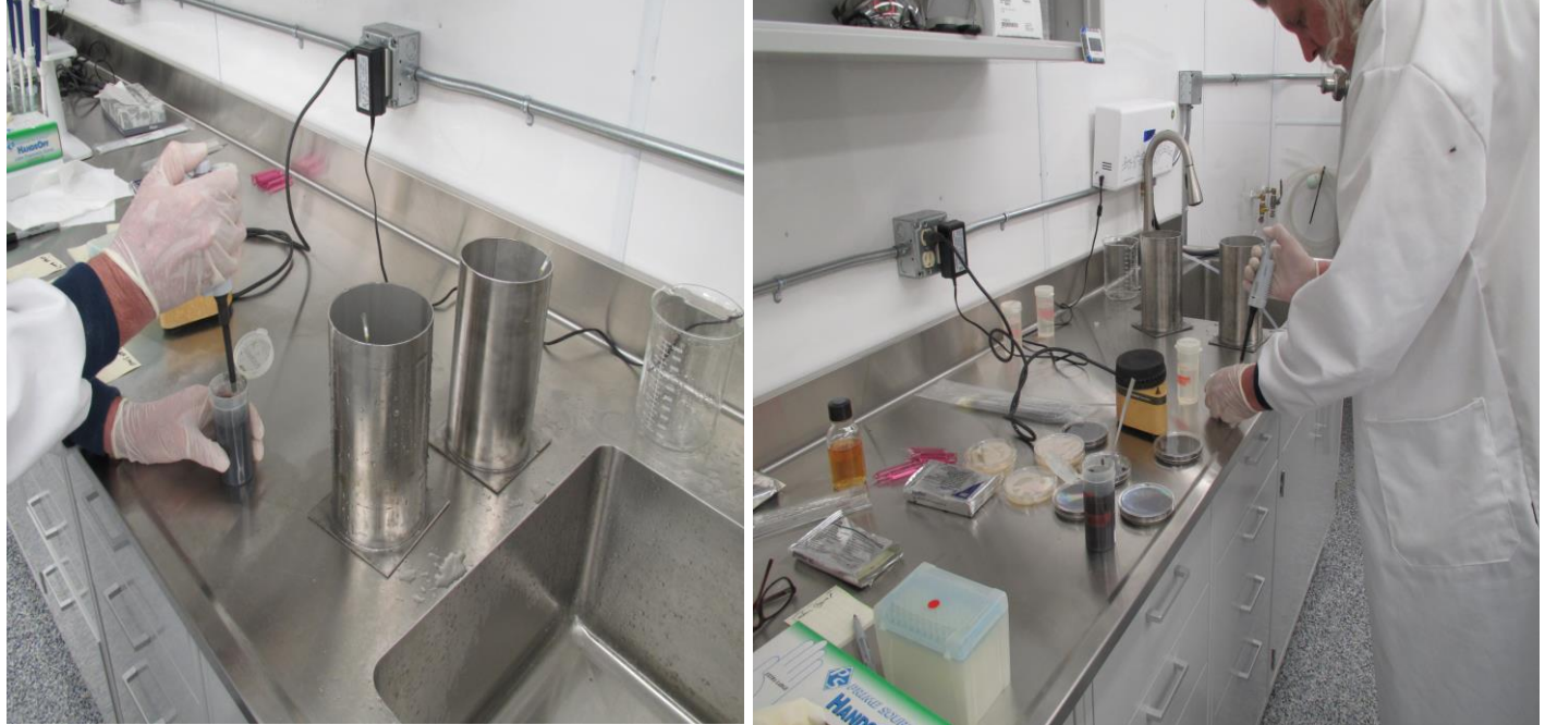
Fig.3- ozone efficacy test.

<u>Results</u> : After 5 minutes the counts in the ozonated water were lower than in the plain water for each of the test organisms, although this was most dramatic for the Escherichia coli and Candida albicans which both had a one to two log reduction. There was less than a one log reduction for all other test organisms.