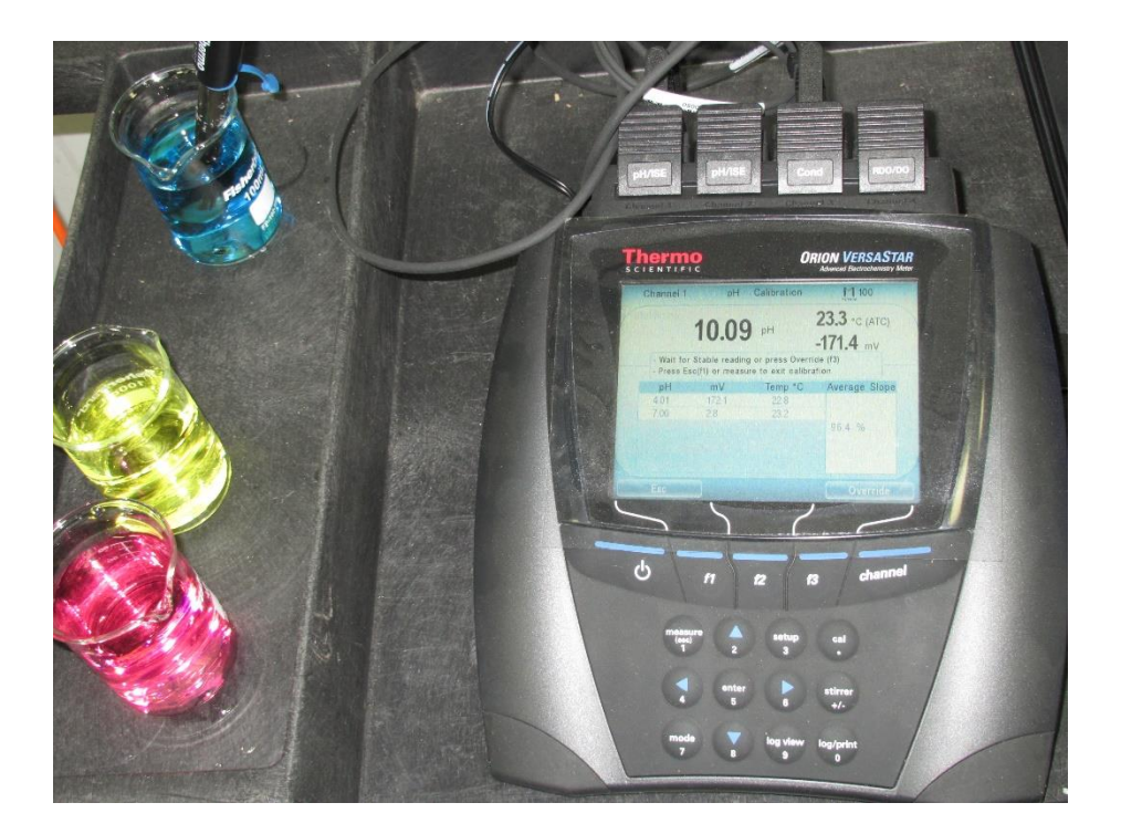
Fig.2- VersaStar pH calibration.

VersaStar pH meter was calibrated before the test to increase accuracy in reading the pH level.